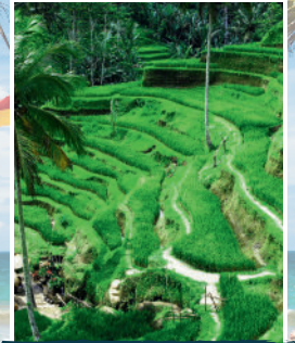
TEGALALANG RICE FIELD