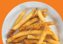
HOMESTYLE FRIES (210 CAL)