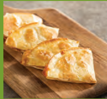
CHEESE QUESADILLA (460 CAL)