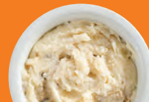
MASHED POTATOES (120 CAL)