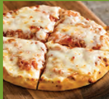
CHEESE PIZZA (500 CAL)