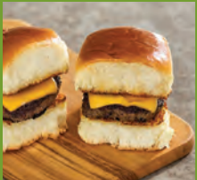
CHEESEBURGER BITES (450 CAL)