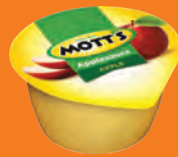
MOTT'S® APPLESAUCE (90 CAL)