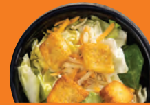
SALAD WITH RANCH (230 CAL)