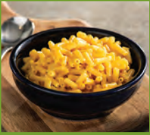
KRAFT® MAC AND CHEESE (310 CAL)