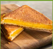
GRILLED CHEESE SANDWICH (430 CAL)