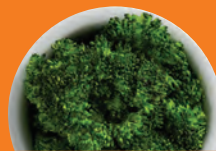
STEAMED BROCCOLI (40 CAL)