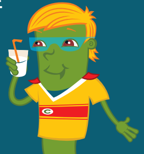
STRAWBERRY LEMONADE ADD .50 (120 CAL)