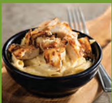
CHEESY CHICKEN PASTA (580 CAL)