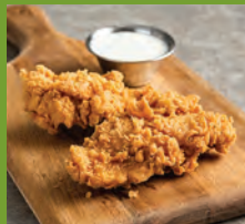
CRISPY CRISPERS® (560 CAL)