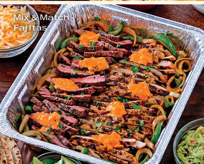
Mix & Match Fajitas